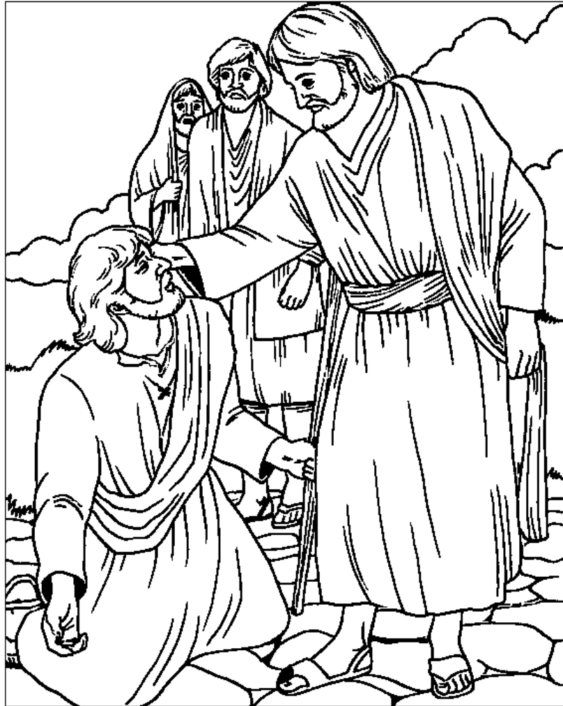
Jesus Heals a Blind Man Mark 10:46-51

From BibleStoryCard Learning System™ Coloring Book © 1996 Wesleyan Publishing House http://www.parable.com/wph/group_1052.htm